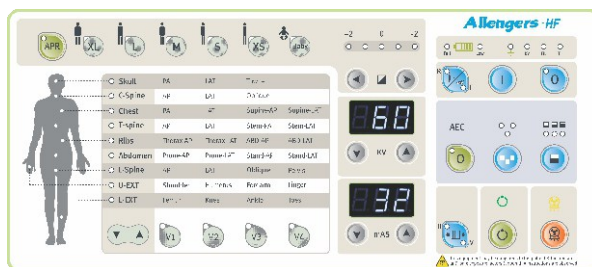
Compact, soft touch control panel

These panels can be supplied in floor or wall mount options and has a spill proof design.