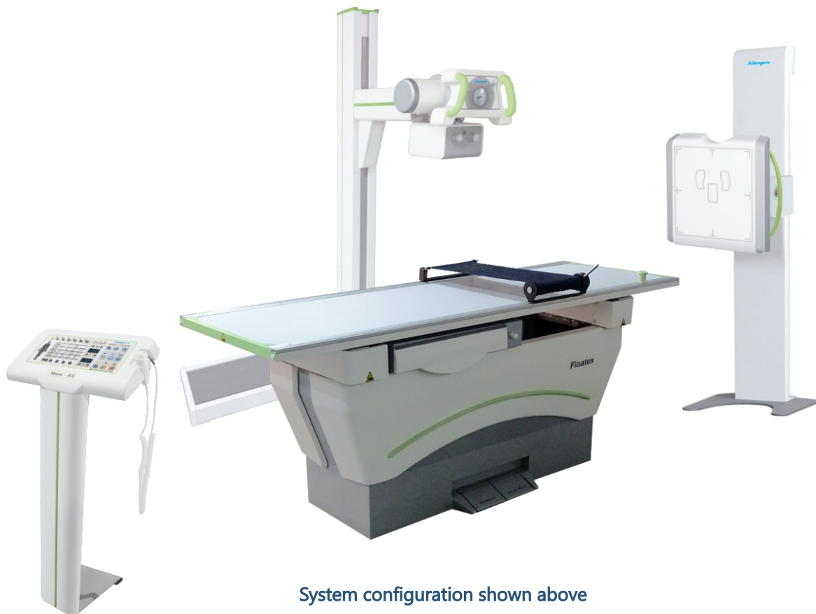
System configuration shown above

Floor mounted X-Ray system with Floatex (4 way movements table) with table top and X-Ray bucky controlled by electromagnetic lock brakes and Vertical Bucky Stand (manual/motorized).